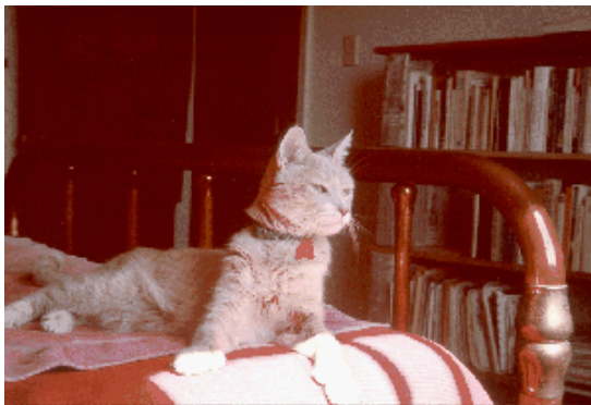
Librarian's cat is commemorated in endowment gift. See story on the Alpha Geoffrey Demetrius Children's Literature Endowment on page 6.