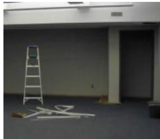
New Branson Hall Title V electronic classroom nears completion.

The Branson Hall Title V Classroom is nearing completion in time for New Mexico State University's Fall Semester. An area on the third floor east of Branson Hall has been renovated with funds from a U.S. Department of Education Title V campus-wide grant from the Developing Hispanic-Serving Institutions Program. The new electronic classroom will serve primarily to teach NMSU faculty members how to incorporate teaching technologies into their curricula. A schedule of classes will be announced. The menu of possible teaching technologies includes Microsoft Powerpoint, WebCT, Microsoft Front Page and Adobe Illustrator, among others. If you are interested in particular software, contact (Electronic Classroom...continued on page 10)