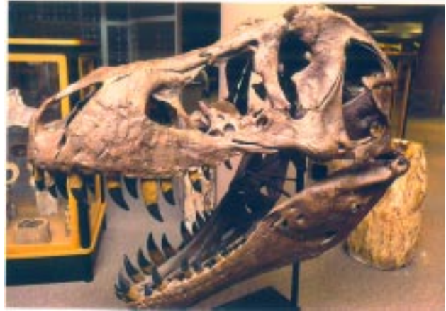
Among the fossils in the Zuhl collection is "Stan," a cast of a Tyrannosaurus Rex, named after its discoverer.