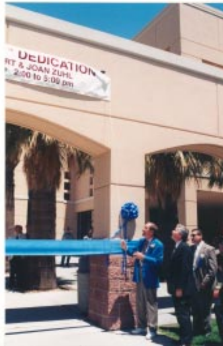
The Zuhl Library Naming Celebration, held on June 16, 2000, was celebrated in great style.