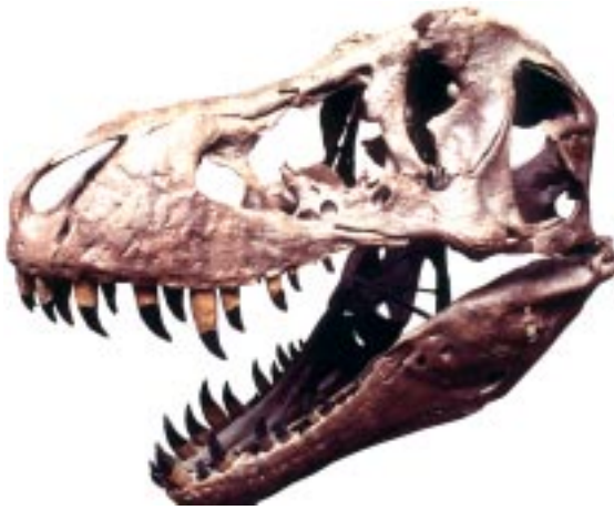
A photo of "Stan" became a logo by removing the background digitally.