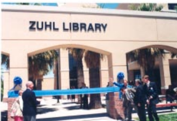
After a trumpet fanfare, the "Zuhl Library" sign was unveiled and the ribbon was cut.