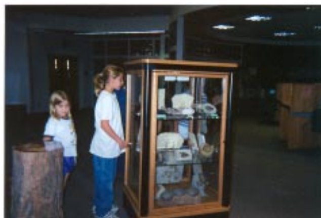
The display is popular with all visitors to Zuhl Library.