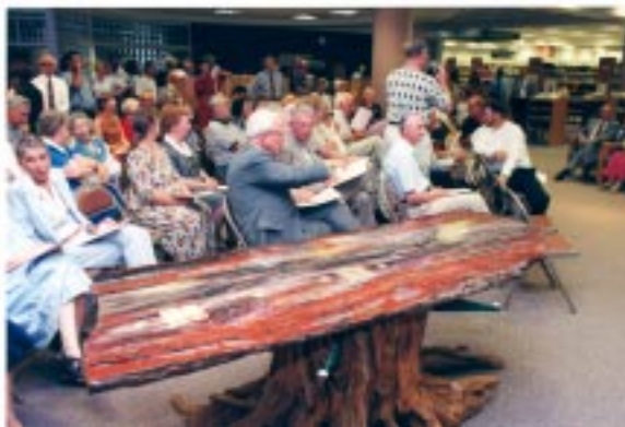
The festivities moved inside the library for a program honoring the Zuhs. Guests were seated adjacent to the display cases for the Zuhl Geological Collection.