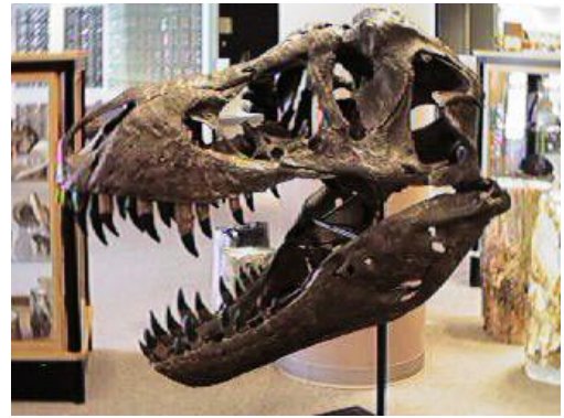
"Stan" keeps watch over the Zuhl Library lobby. The image and concept are used in many campus and community publications.