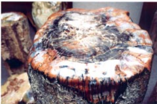
Tops of some of the petrified logs were polished with a new technology developed for this collection that brings out the beautiful colors in concave and convex surfaces.