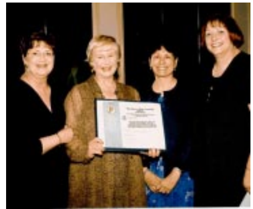
Library staff, family and friends enjoyed the ceremony for the John Cotton Dana Library Public Relations Award at the 2001 American Library Association Conference in San Francisco.