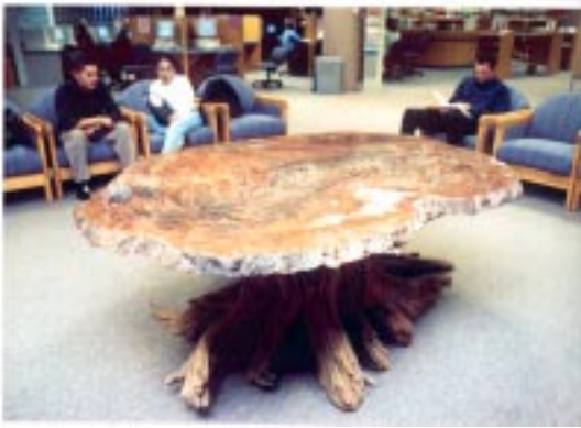
NMSU students enjoy the beautiful geological collection on a daily basis.