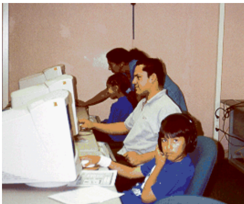
Parents and children enjoy a BIEN! health information training session at Thomas Branigan Memorial Library on March 9, 2001.